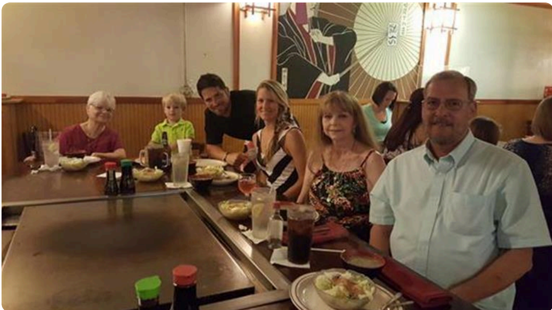
Mother's Day 2015