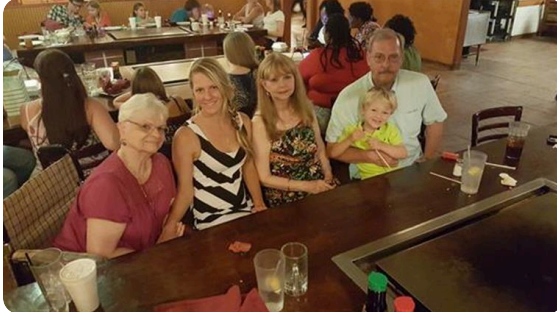
Mother's Day 2015